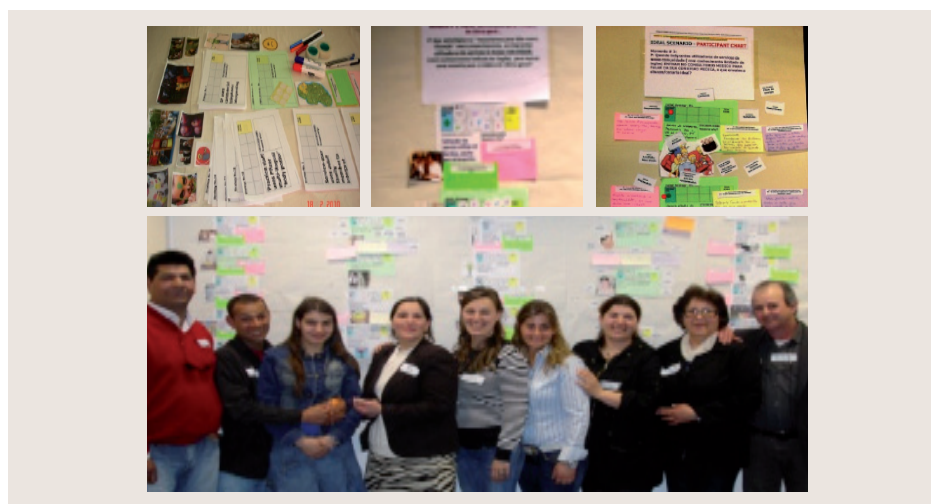
PLA 'flexible' research materials, Direct Ranking Chart, and section of Ideal Scenario Chart produced by research participants SUPERS PLA Research Sessions, NUI Galway, April 17th 2010

Details of these strategies are set out in the following pages. All strategies were generated by stakeholders during fieldwork processes, and each element of each strategy can be traced back to specific research encounters with one or more stakeholder groups.